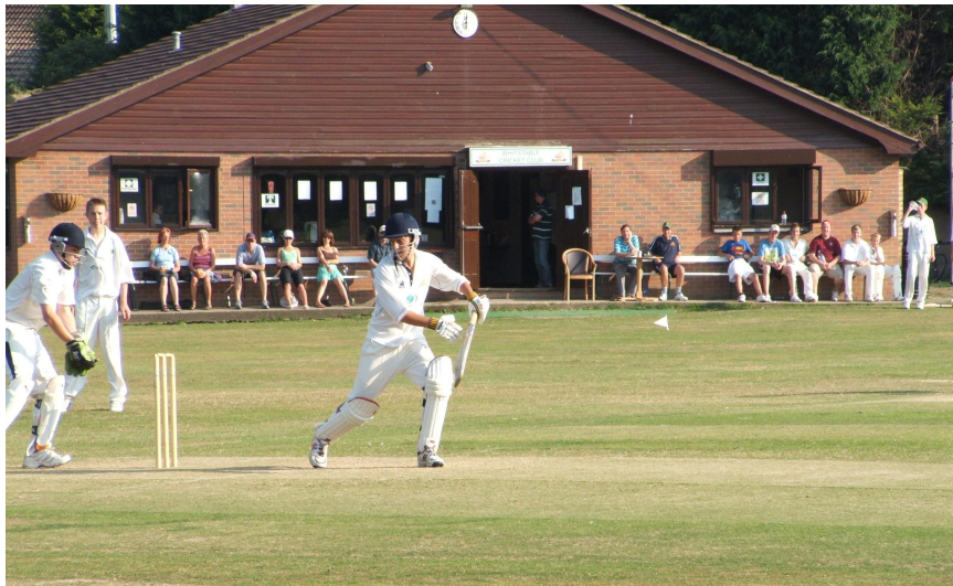
The Belmont Ground, Whitstable